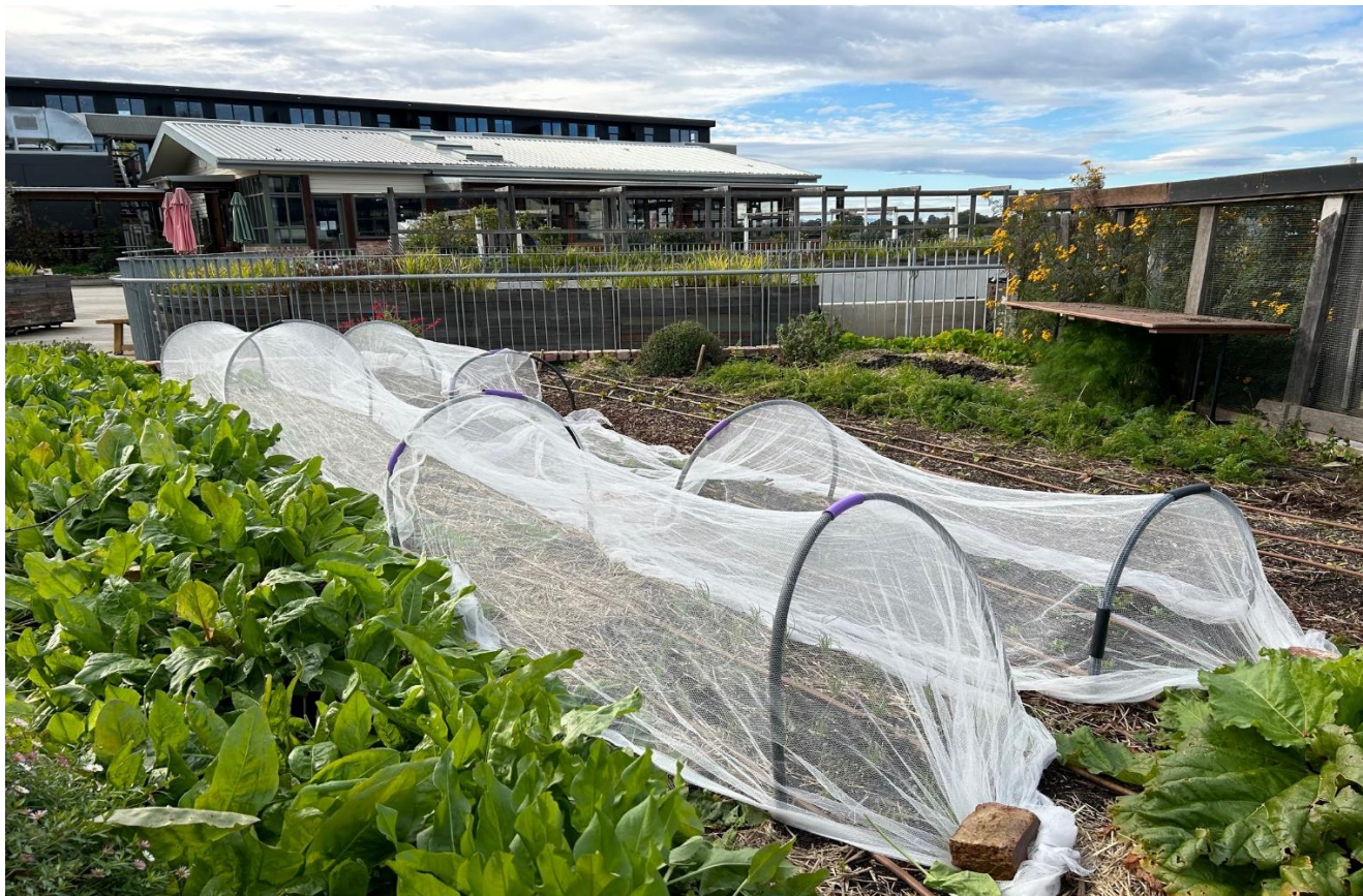
Planting in progress

“It felt natural to bring them to the Rooftop Farm from April and each Thursday the group are on site working and learning. It is expected that more of this CALD community will engage in the farm on different days of the week over the coming year thanks to support from philanthropic funders, donations and grants. We work closely with the Victorian College for the Deaf and their Urban Block Gardening Group but are expanding to work with other related groups looking for work pathways at the start of Spring.