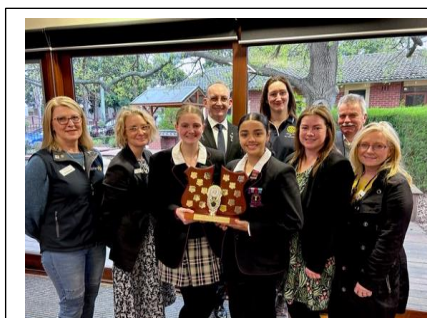
Winners, Staff and Rotarians