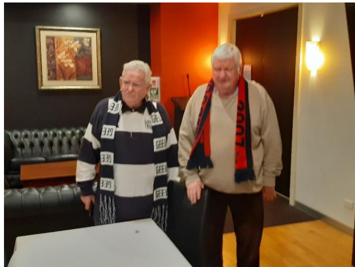
The "Wouda Beens"