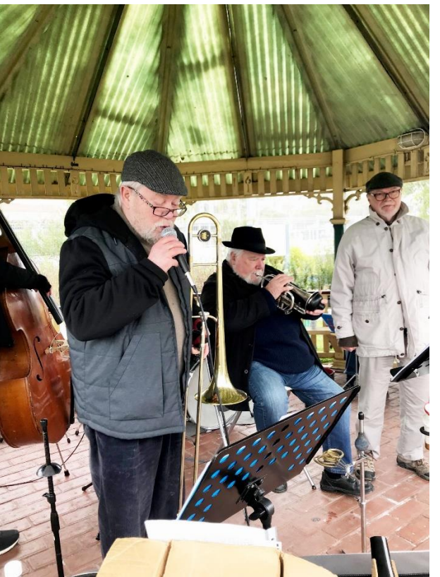
THE SKIDADDLE GROUP