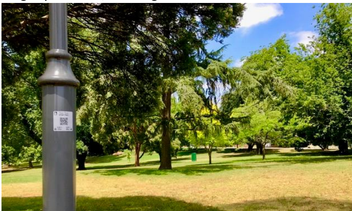
Kingsley Gardens, showing a QR code

Visitors having a wander through Kingsley Gardens in Box Hill can access short, informative videos by scanning QR codes on-site. The videos provide an opportunity for people to connect and care for nature by hearing from staff and volunteers, sharing insights on tree identification, species selection and tree care.