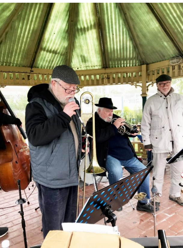
THE SKIDADDLE GROUP