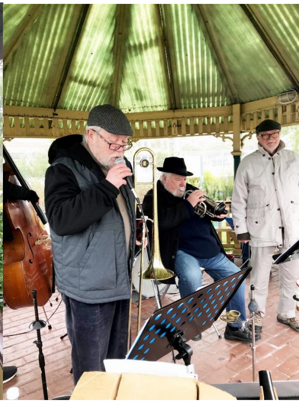
THE SKIDADDLE GROUP