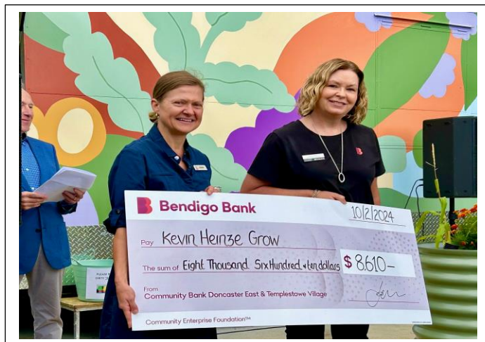
East Doncaster Cricket Club cheque