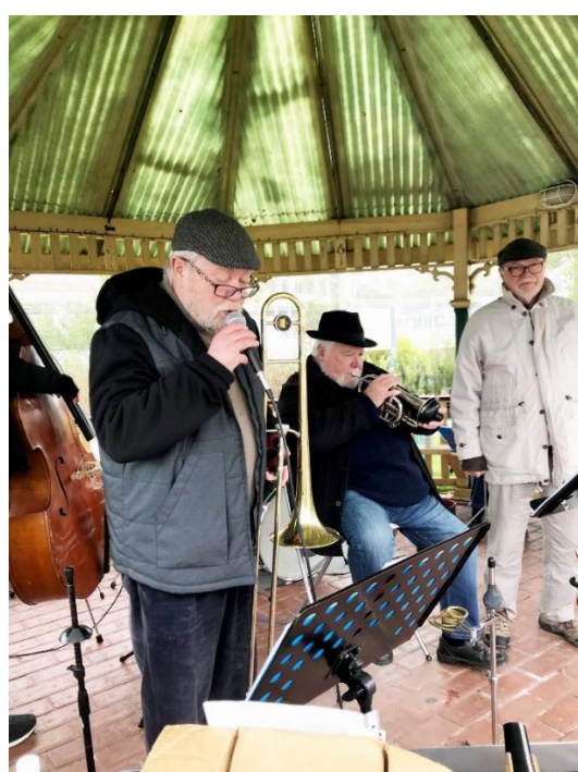
THE SKIDADDLE GROUP