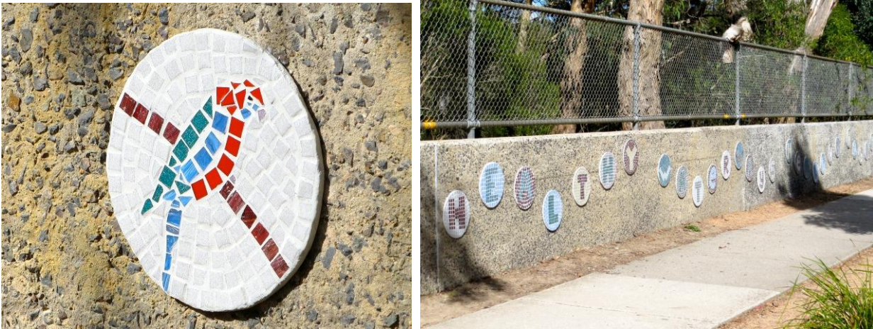
Lorikeet looks familiar