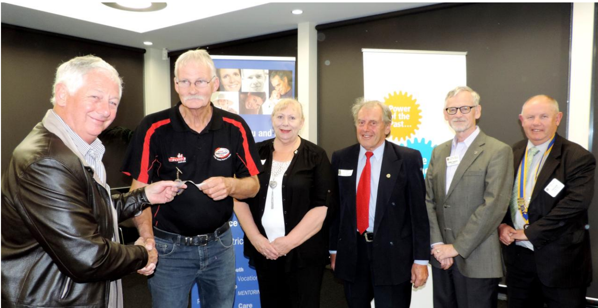
Hand brake turn Cluster meeting $5,400 cheque presentation- Fabulous Night

Projects for All: You can link to projects which provide connections to children and to every age group to centenarians. From Lego Collecting and Books for Babies through to Card Writing for the Elderly; Rotary offers something for you.