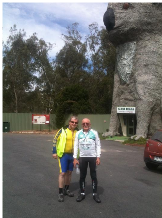
Sight seeing on the cheap!