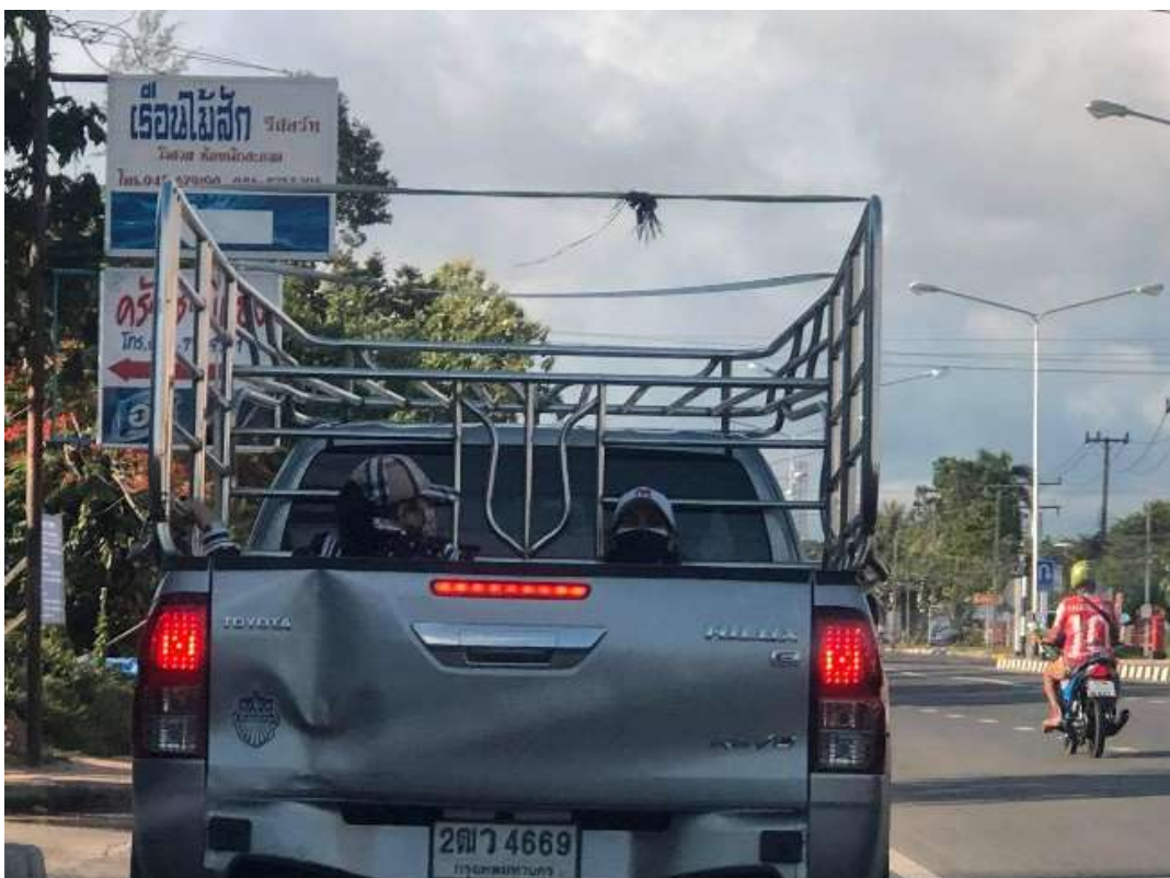
1,200 km in the back of a ute.