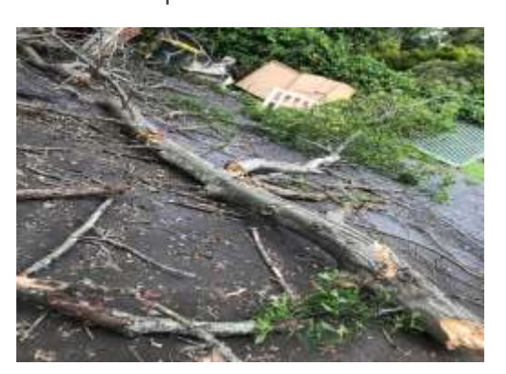
Feb 21: Front drive, part of garage smashed.