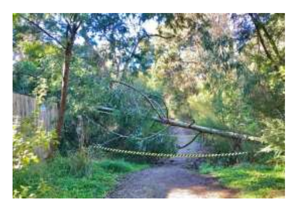
June 21 - our back fence - two days ago

The February insurance claim led to garage repairs that were only finalised last week.