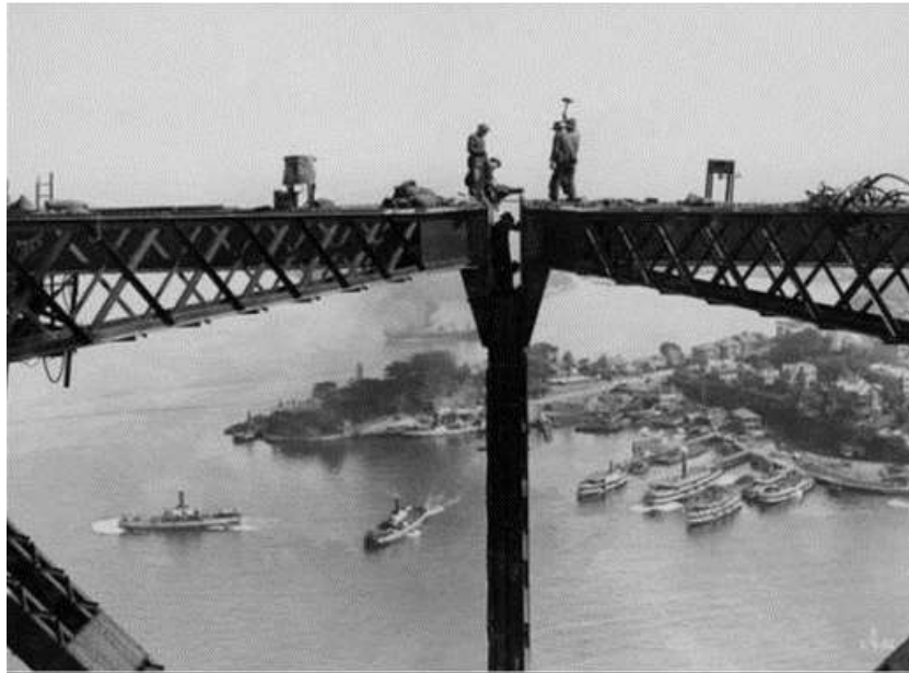
Sydney Harbour Bridge 1930