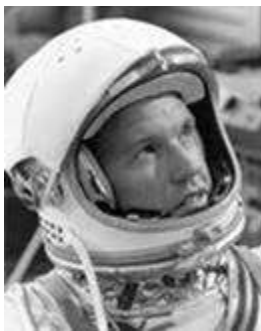
~ John Glenn...

Something to think about while you cannot go out and play!