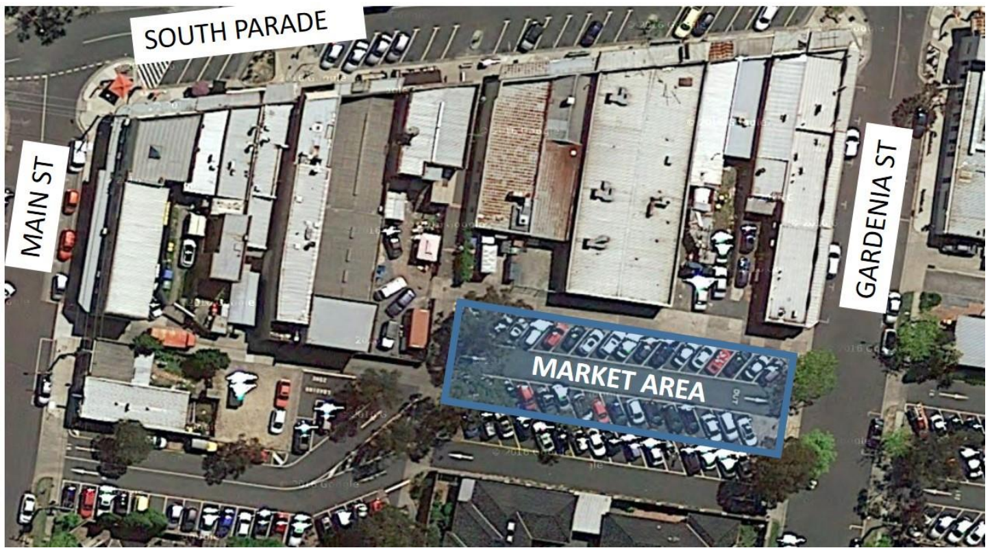
Blackburn Market Temporary Relocation