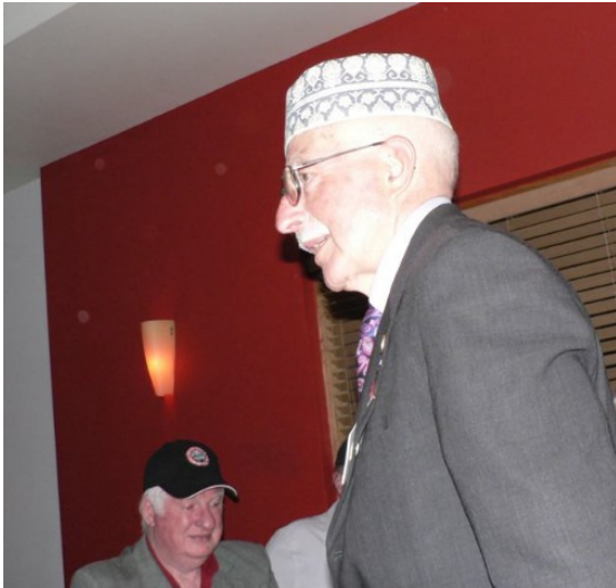
ARH Hat Day at Forest Hill