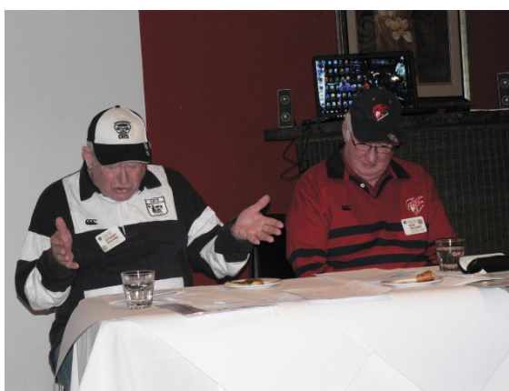
Well if you don't know what's going on what hope do we have