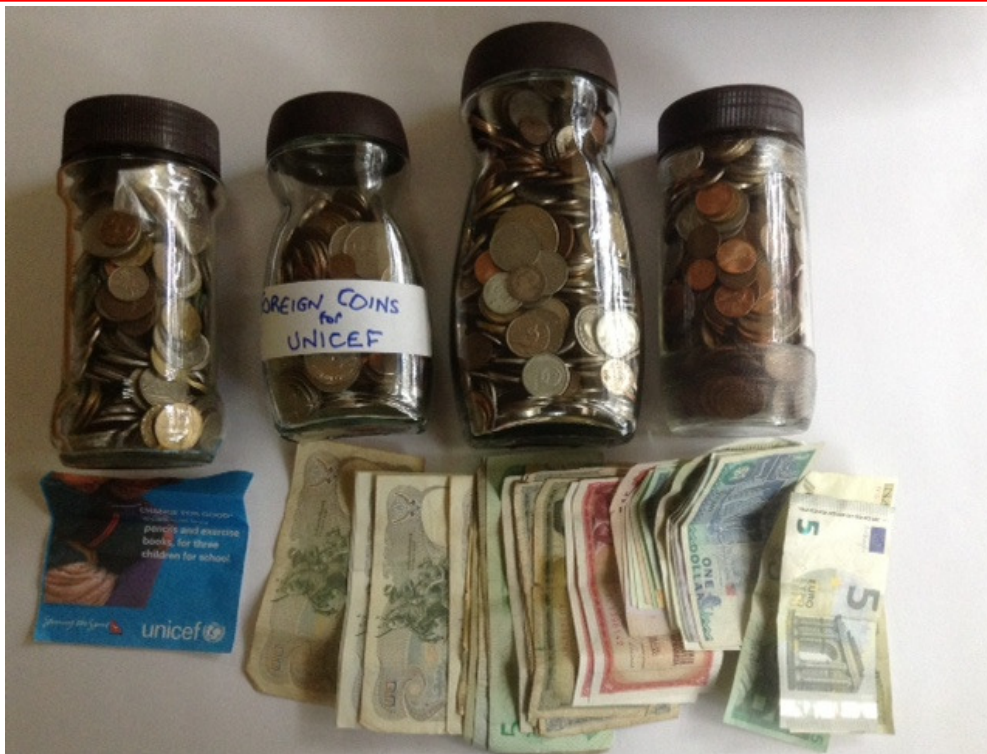
The foreign coin collection is underway

More and more of us are heading off overseas and we always seem to return with some useless coins we cannot exchange (We'll take notes as well). There will be a coffee jar to put the coins in and each week we'll see the collection grow. This was done some years ago and so now that coin collection has built up again. UNICEF can make use of them. Let's recycle our coins into something valuable for kids.