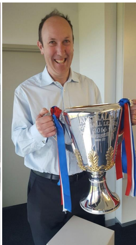
Serious business this footy