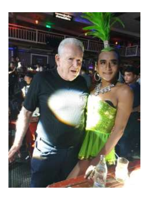
Super Stu presumably with Lois Lane?

View from 15 storeys as he is about to take off.