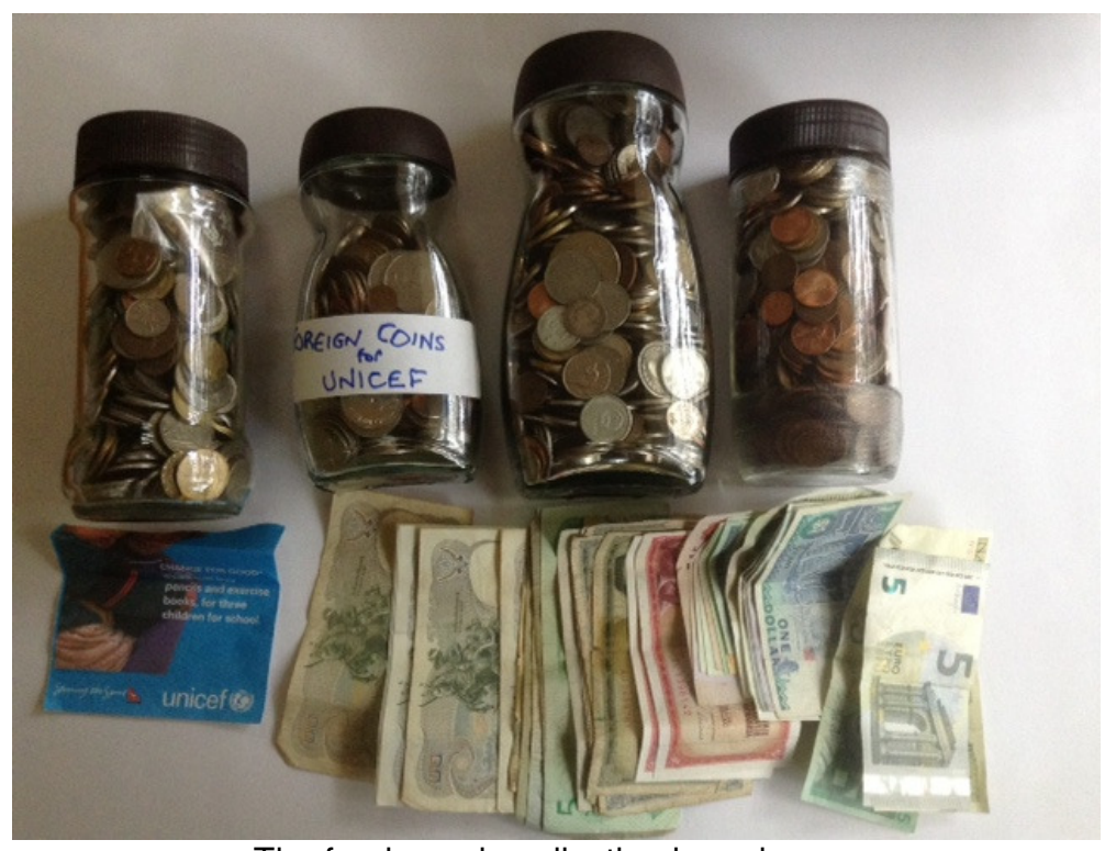
The foreign coin collection is underway

Thanks to John Bindon the coffee jar collection of coins is growing. UNICEF can make use of them. Let's recycle our coins into something valuable for kids.