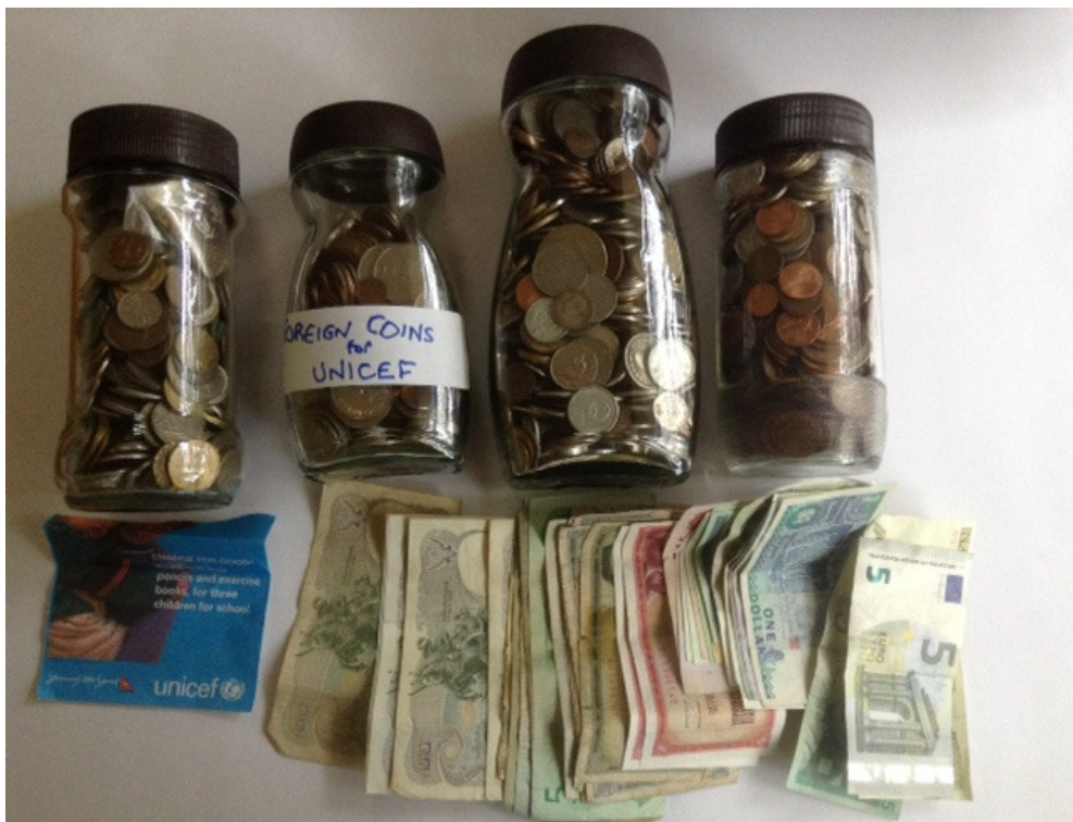
The foreign coin collection is underway

UNICEF can make use of them. Let's recycle our coins into something valuable for kids. I'm collecting notes as well.