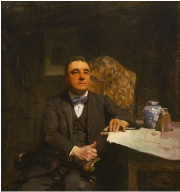
FIRST WINNER 1921

For some reason I can never forget the winner in 1972. The hands were so expressive.