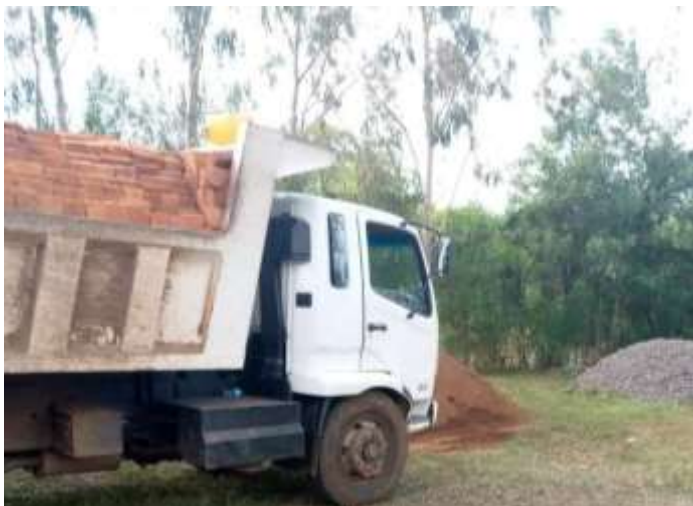
Above: Bricks arriving.