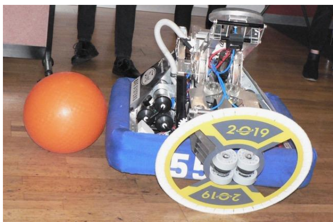
"Muck" the robot.