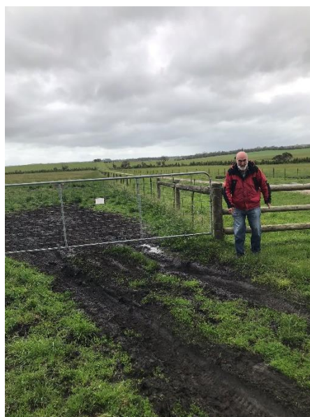
I'm sure I had boots on when I left home!