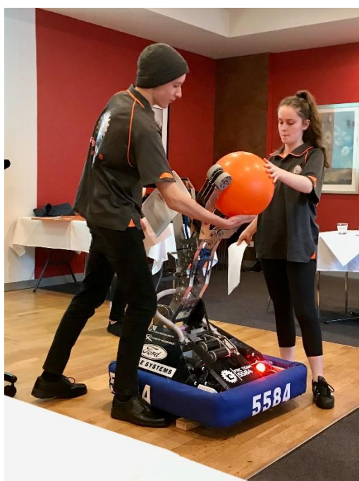
"Muck" thinking about going to work.