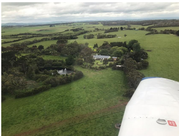
Looking down on the farm