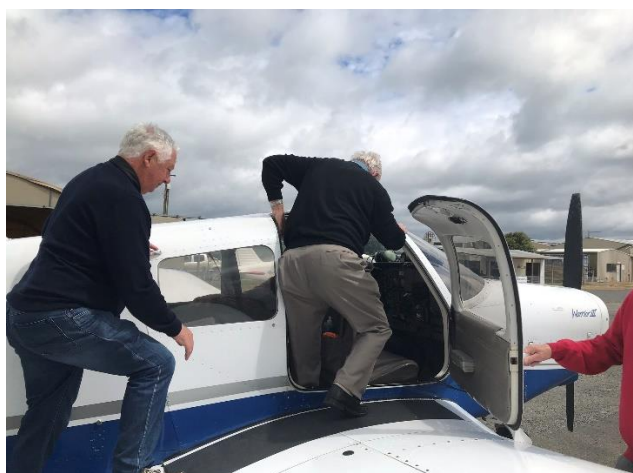
I thought you said it was a 747!