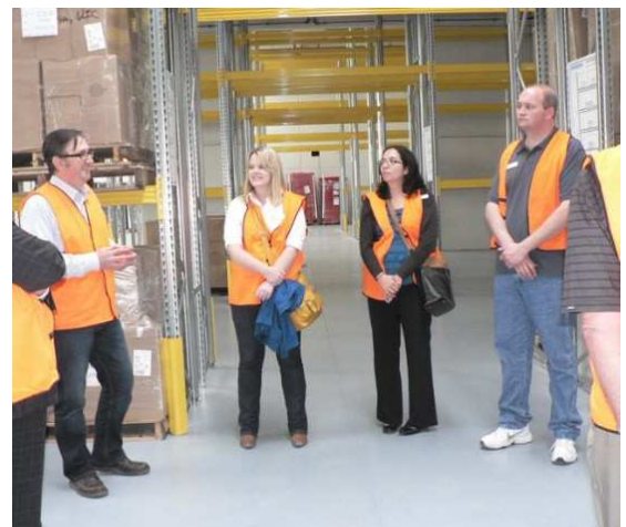
GSE Team at SCOPE

Our hosting of the GSE Team from Texas was very successful. The Team enjoyed their visit to NADRASCA and SCOPE and we thank both organisations for the time and effort they put into their presentations.