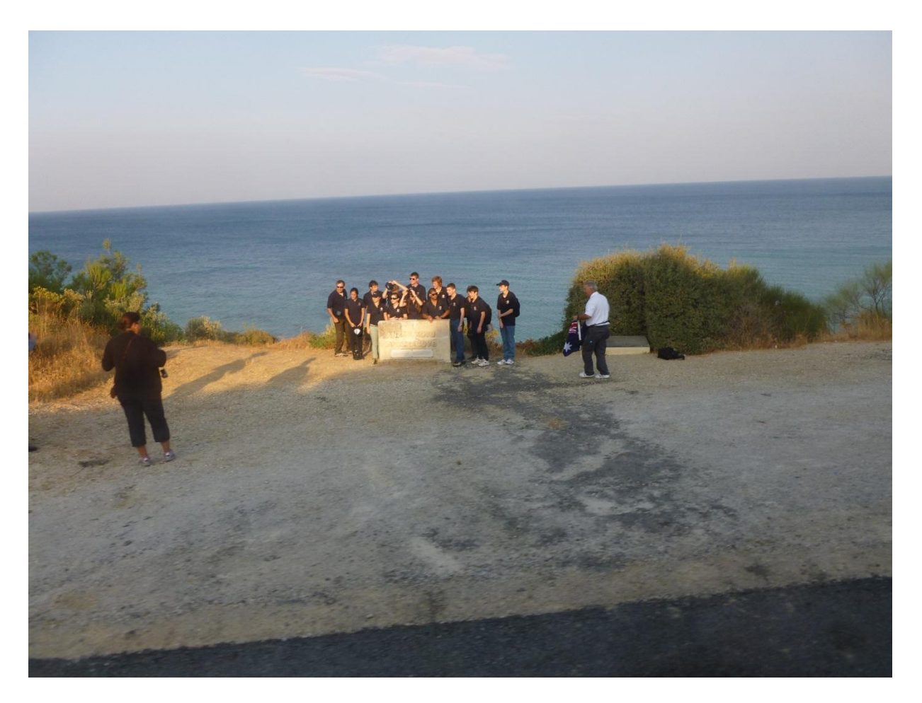
Students visiting Anzac Cove