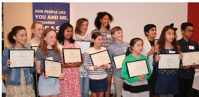
11 happy Awardees with Rose