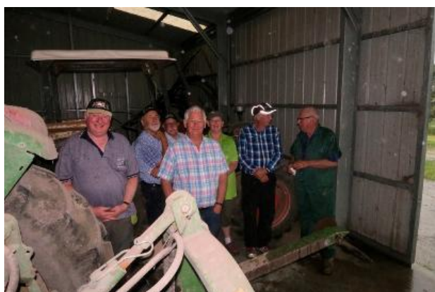
Visit to Davis farm

I'm sure Rotary has been going along at its usual frenetic pace but I must say it has been good to just tune out for a few days.