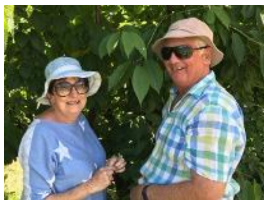
Tuck's cherry orchard