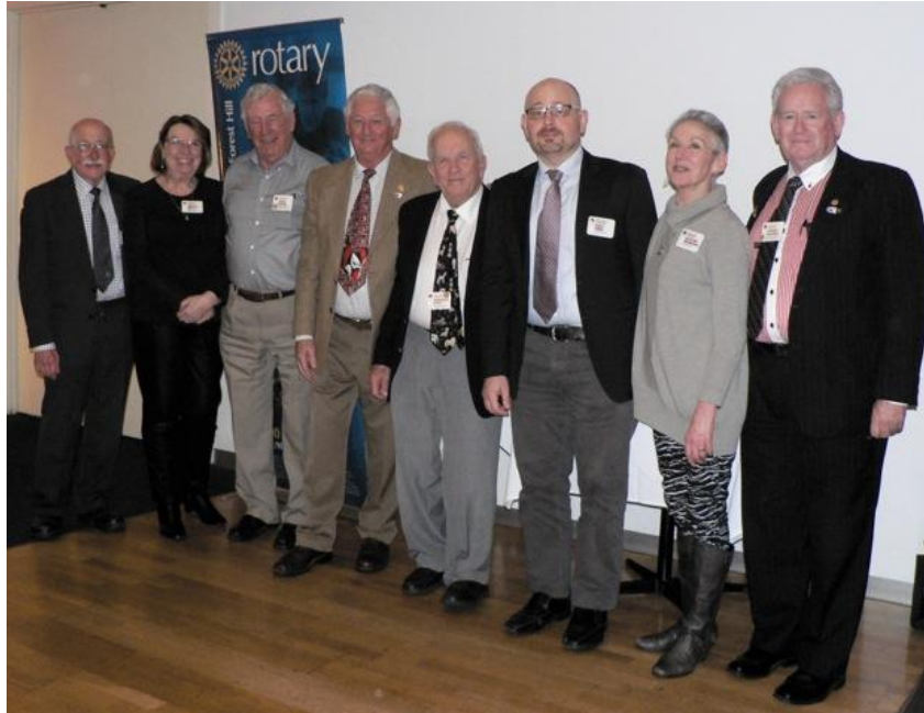
The bulk of this year's Board- a lightweight absent