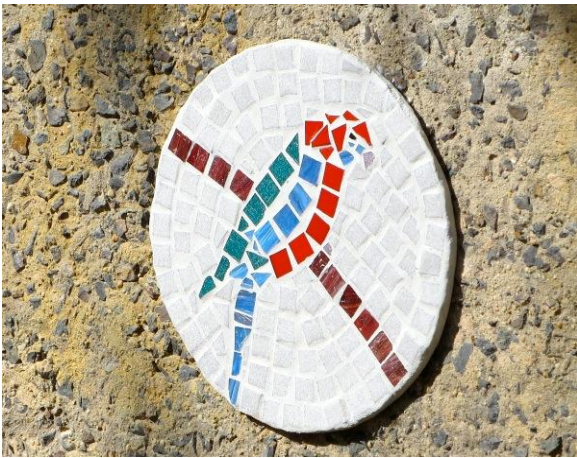
Lorikeet looks familiar

We will need to organize the setting up of the barbecue near the Information Centre at approximately 5.00pm So, see Ray about helping out.