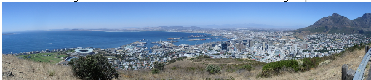
Cape Town and the new "do nut" stadium. Great view