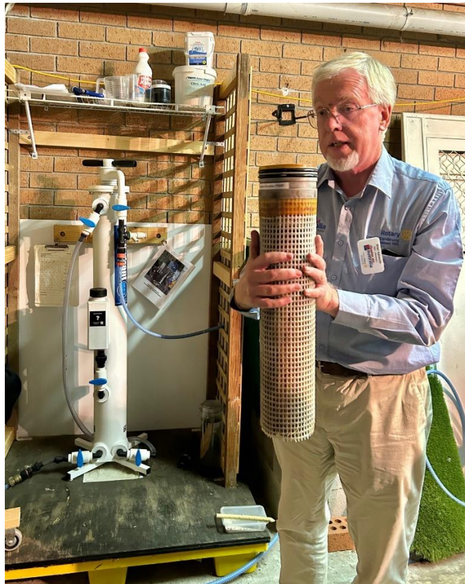
The ultrafiltration core