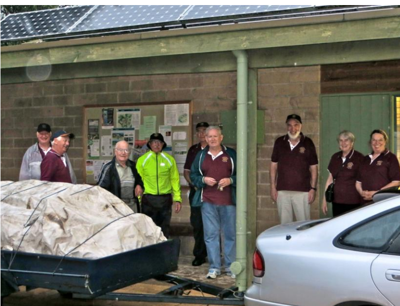
Job well done