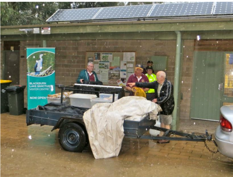
Packing up in the rain !!