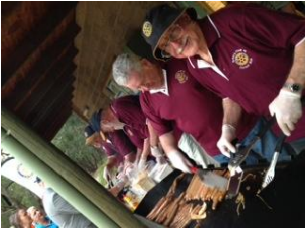
Industrious line up