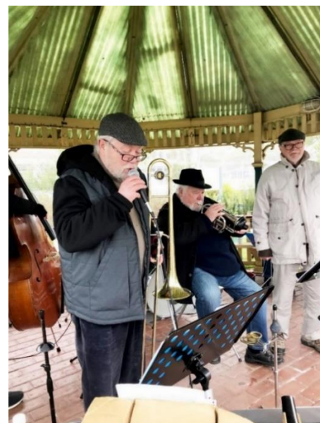
THE SKIDADDLE GROUP