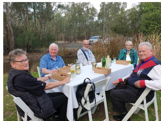
Instead – a boxed lunch!