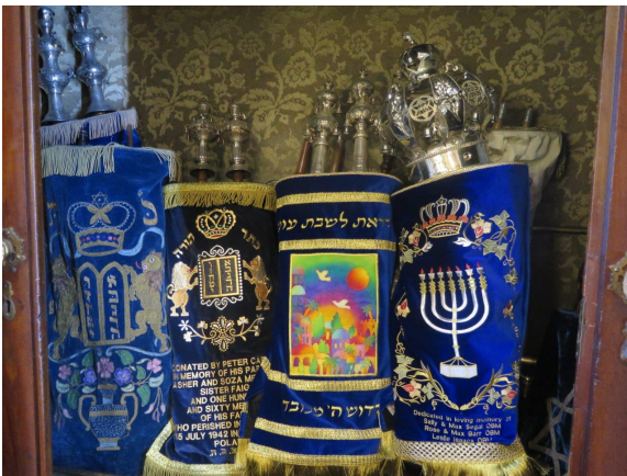
Old and new Torahs