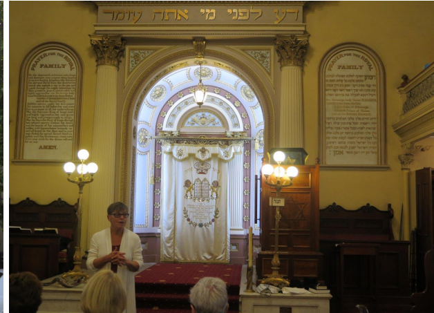
Ark, prayers, "Be aware of who you stand before"