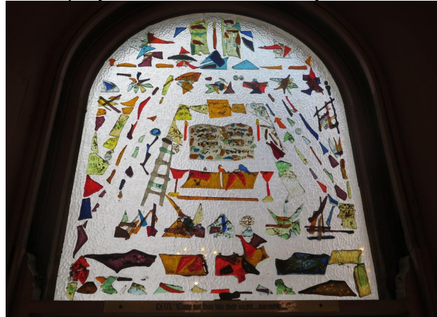
A stained glass window

Presently, there is a special exhibition at the National Gallery Victoria showing the works of Andy Warhol and Ai Wei Wei . While AW precedes AWW timewise, they