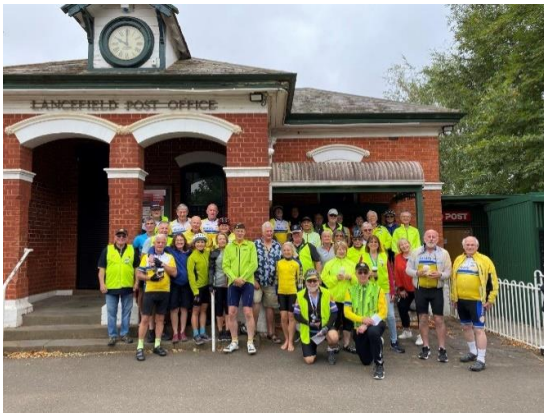
Start in Lancefield

This year this fund-raising event had three teams each led by a vehicle and followed by a vehicle with a second towing a bike trailer. This made it a very safe ride. I rode in the middle blue team 538.4 kms over 6 days starting in Lancefield and finishing near Nagambie at Kirwan's Bridge. A few in the top team could have ridden up to 40kms further. There were three days running over 100kms. Each night we stayed at the same motel in Bendigo doing loops out in different directions (so how come the strong wind was always in our face?). We had no rain and the weather was relatively cool generally in the 16 to 26 degC range. Each of us were given a special ride shirt to change into every evening which traditionally always starts by having a few drinks and nibbles at the motel run by Club Chardonnay. We went to a different venue each night for dinner but no Rotary club dinners. The profit made by Club Chardonnay goes to ARH so we took our fund raising seriously and had a few drinks!