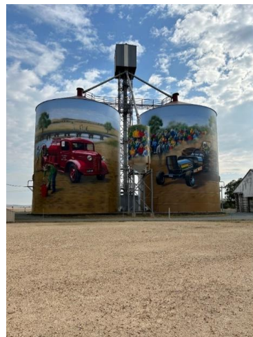
Silos at Colbinabbin