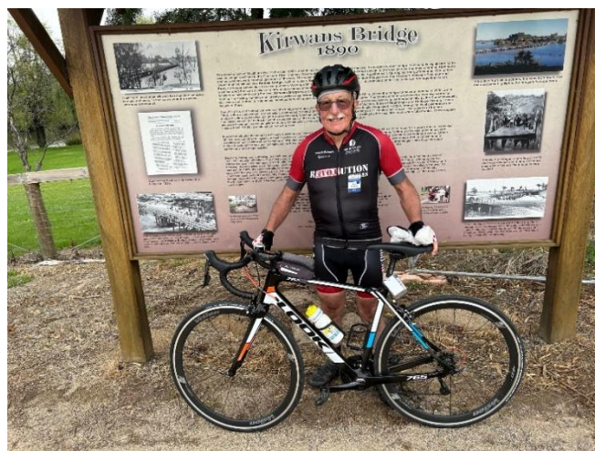
The finish in Kirwan's Bridge, Nagambie