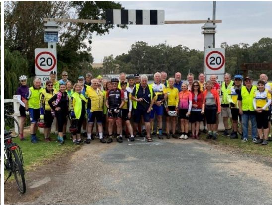
Finish in Kirwan's Bridge