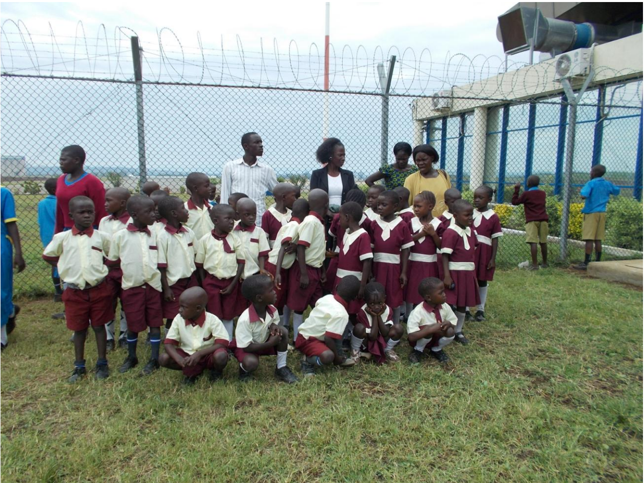
Hope Katolo children on an excursion