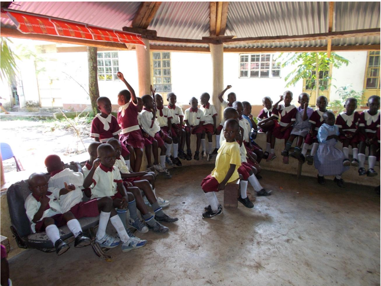
Another photo from Kenya of the Hope Katolo nursery school children