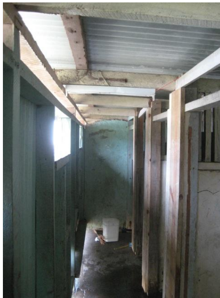
Old run down toilet block (more photos on the web)