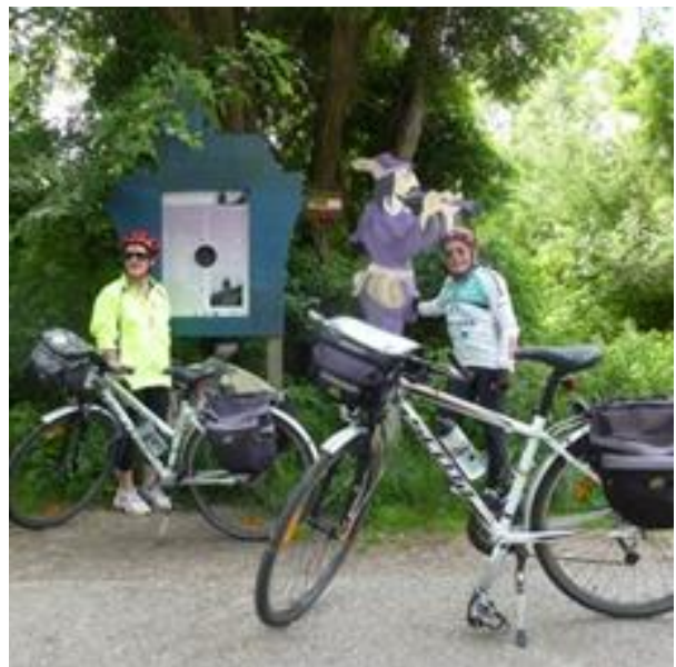
Korneuburg, Austria (Pied Piper home)