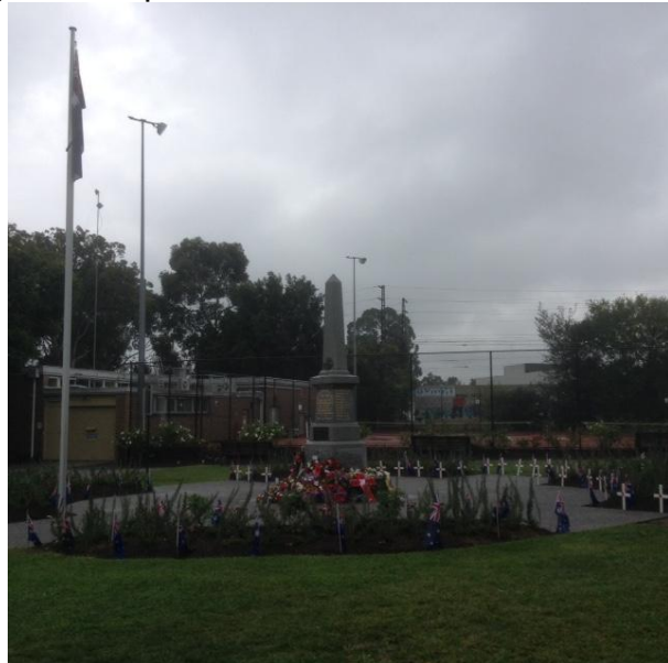
Memorial at Morton Park, Blackburn after the crowds had gone