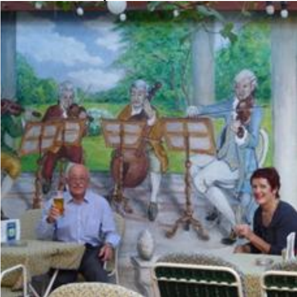
Hainburg, Germany still 800kms to go