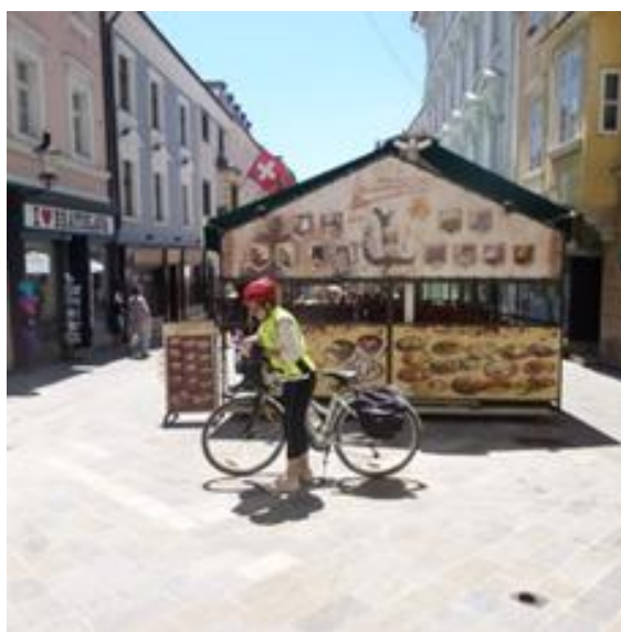
Bratislava, Slovakia - our lunch stop