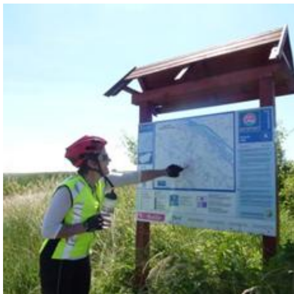
Looks like we are in Hungary

Newsletter articles to the editor at ronbrooks1@optusnet.com.au by 5 pm Wed