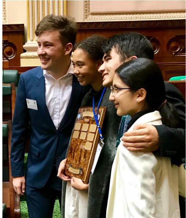
This year's winners