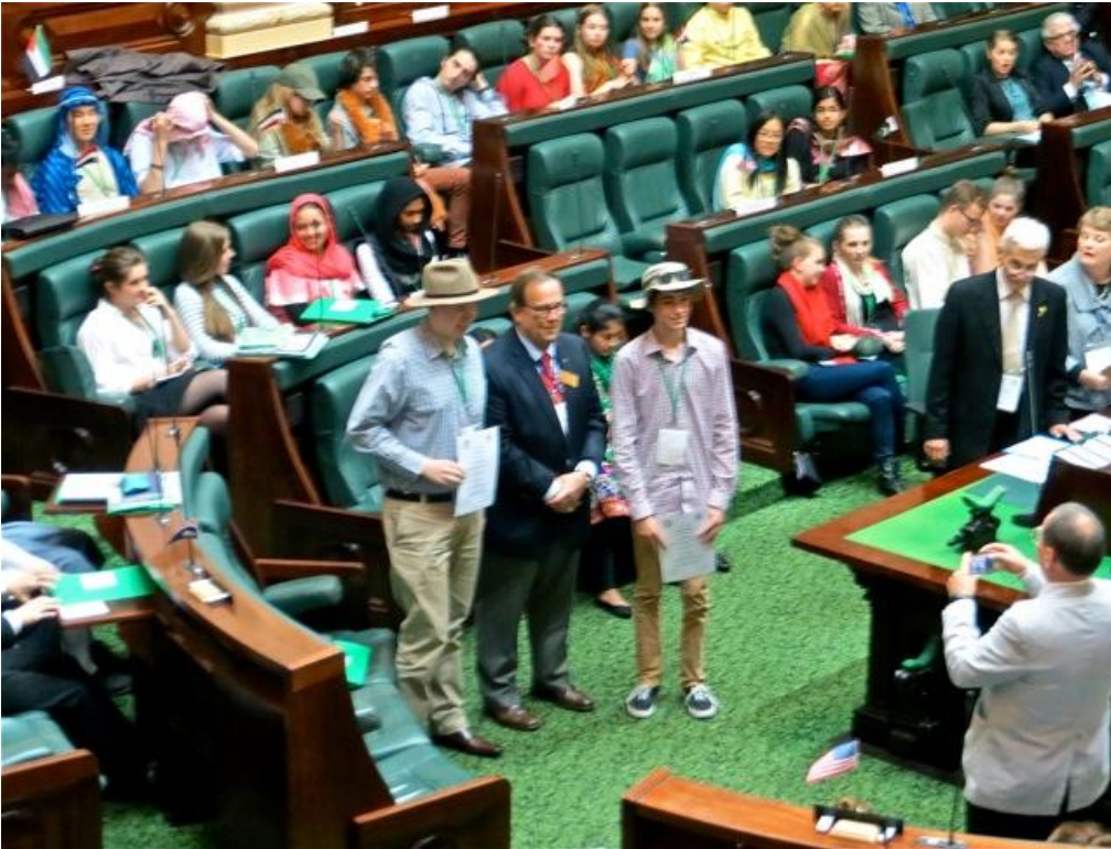
The Aussie team from Kingswood College