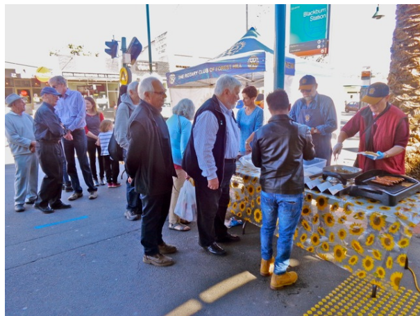
Queue forming for our great sausages