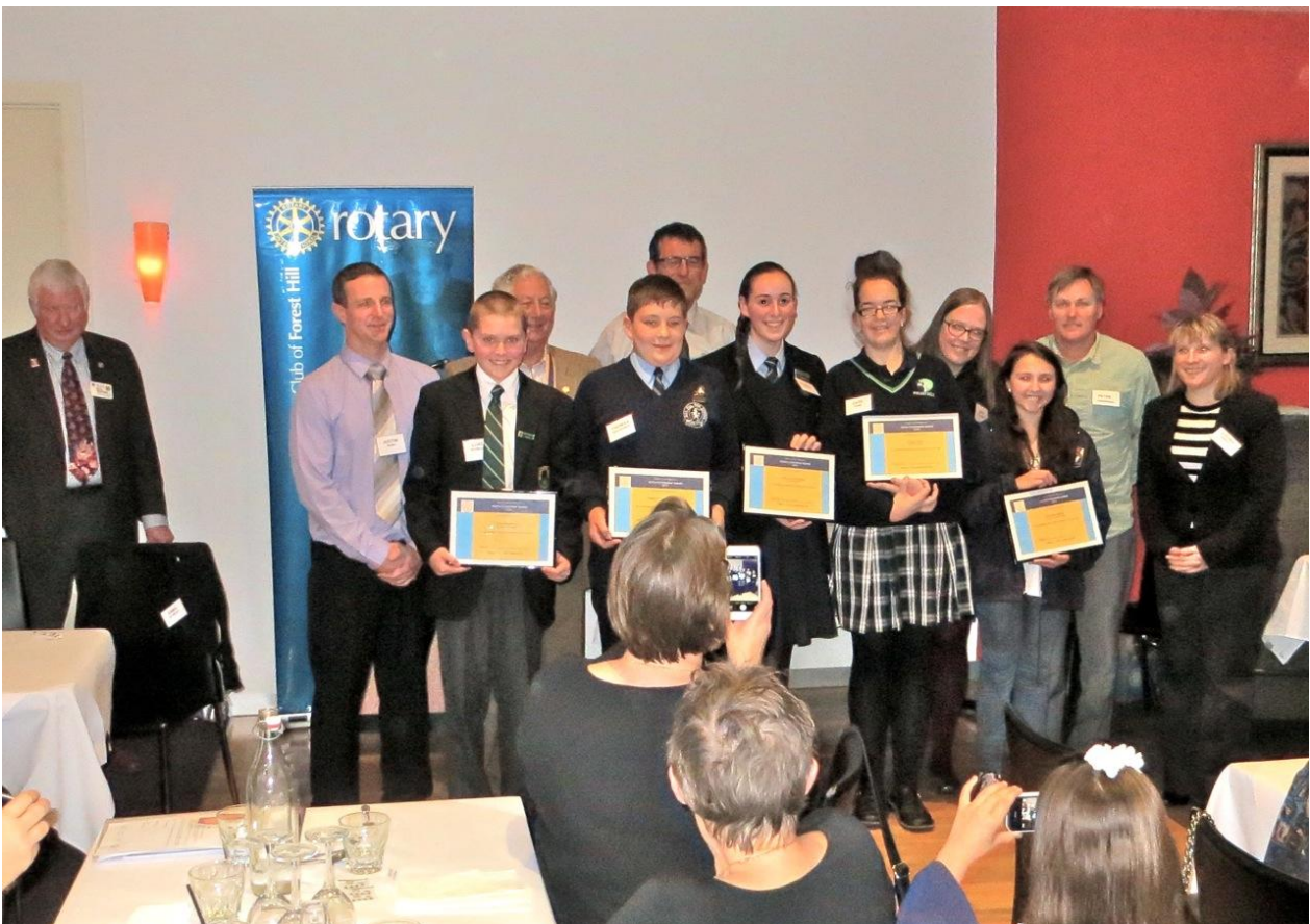
Students, teachers and Rotarians