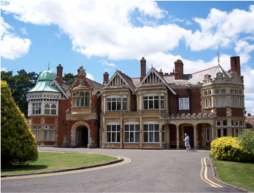
Bletchley Park today www.bletchleypark.org.uk