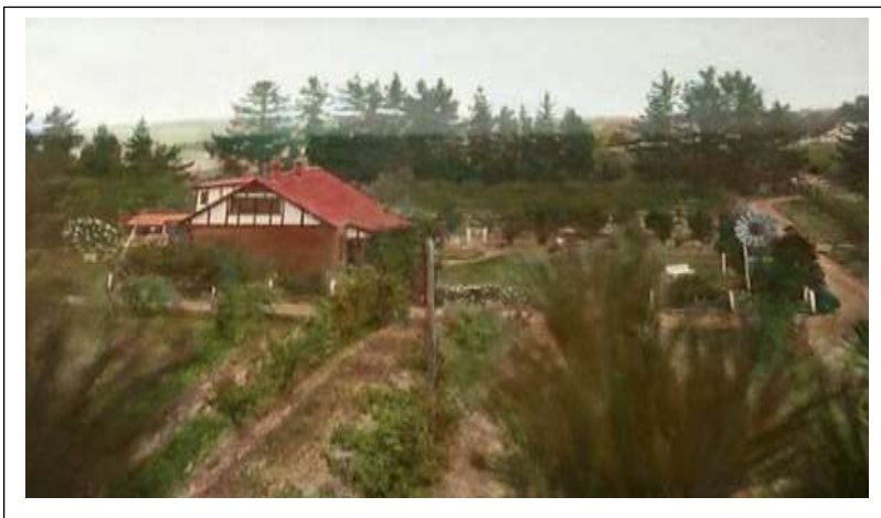
View from Overway pines across Strathdon front garden looking south to Tainton's circa 1941. Image from the collection of Charles Matheson. Source: (Gilfedder et. al, 1992)

Vermont -The story of a Community. An archive of the history of Vermont.