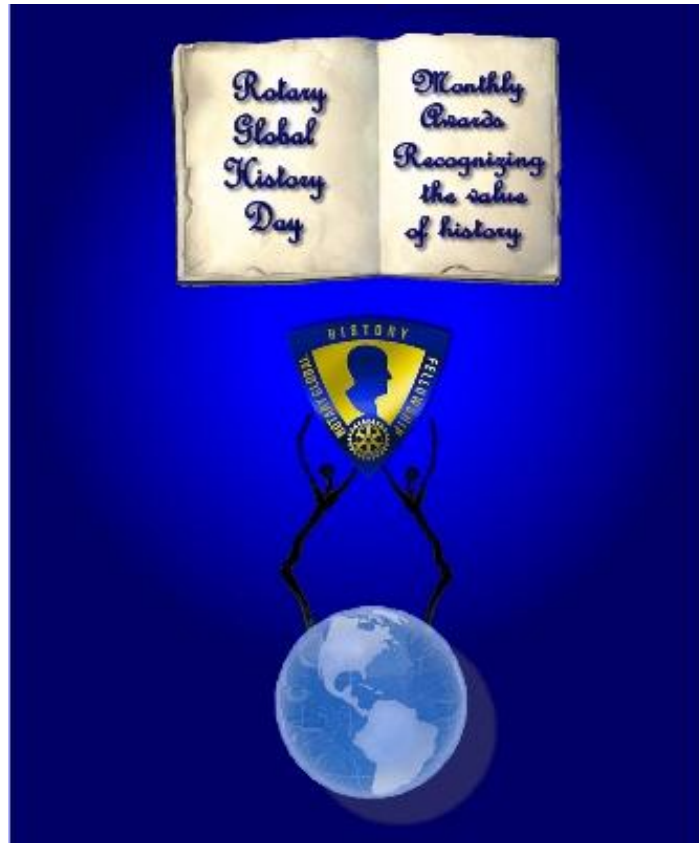
History Day at RGHF, honouring the First 100 Clubs of Rotary